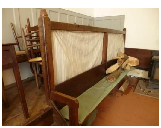
Statement of Significance

Rookhow Friends Meeting House has exceptional heritage significance as a fine example of a purpose-built meeting house erected in 1725 to serve Swarthmoor monthly meeting. It retains many historic fittings and the original layout along with a good collection of furniture. The building has an unspoilt Lake District setting with adjoining ancillary buildings and woodland, and is used as a holiday and retreat centre.